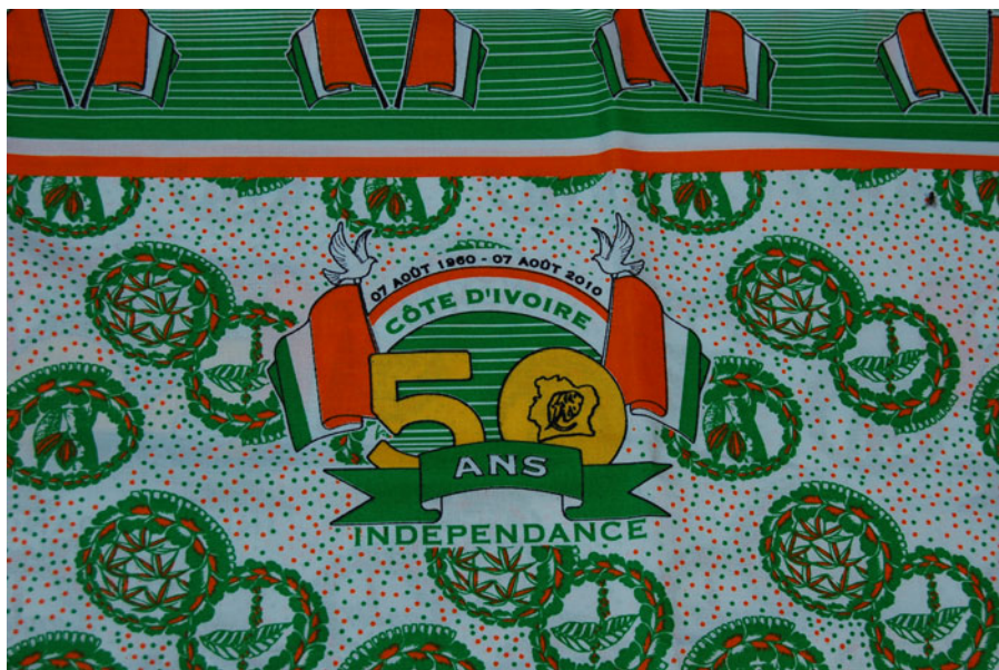
Figure 15: Cloth produced for Côte d'Ivoire's 50th anniversary of independence, 2010, © Konstanze N'Guessan.

to 'remember how Kufuor and his political tradition . . . fought against independence', and in another article complained that Kufuor's party 'did not see anything good in Kwame Nkrumah, but now they are robbing the CPP [Nkrumah's party] of this magnificent glory of the 50th year anniversary' ( The Democrat , 6 March 2007, No. 57).