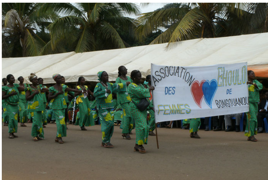
Figure 11: Women's delegation taking part in the parade held on Independence Day, Bongouanou, Côte d'Ivoire, 2013.