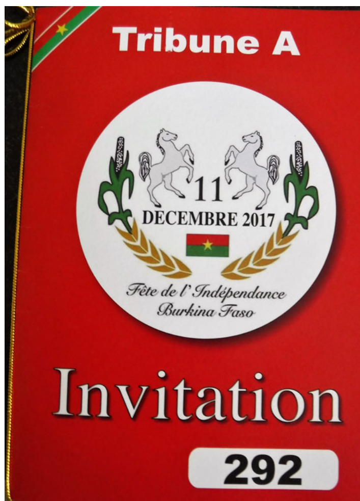
Figure 13: Invitation card for the parade held on the occasion of the 57th anniversary of independence in Burkina Faso, 2017.

The Ghana@50 celebrations, for instance, provoked numerous debates which were continued and reported on in the national newspapers. There were debates on the level of political inclusiveness of the festivities, the elite-centrism of the festivities, issues of corruption, and the question of who should be commemorated as the ‘true’ father(s) of independence (see also Lentz 2013c; Lentz and Lowe 2018). The irony was that the Kufuor government organising the jubilee saw itself as standing in the tradition of what was once the opposition to Nkrumah, Ghana’s first prime minister and president. Independence, however, could not be celebrated without reference to Nkrumah. The jubilee organisers launched the year-long Ghana@50 celebrations precisely on 21 September 2006, Nkrumah’s birthday, which was certainly an attempt to avoid criticisms that Nkrumah was not duly commemorated. Furthermore, large billboards erected across the country and repeated newspaper advertisements showed Kwame Nkrumah and President Kufuor, standing left and right of the Ghana@50 logo and the ‘Championing African Excellence’ slogan. Both were clad in kente cloth (see Figure 12), quoting Akan royal traditions, and