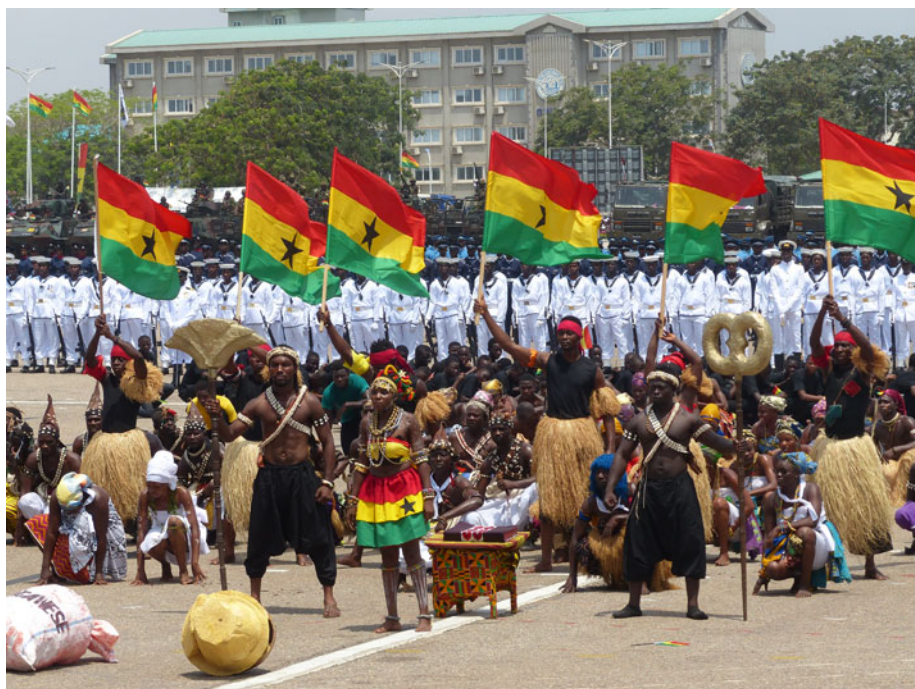
Figure 6: Cultural performance presented before the parade on Ghana's 60th anniversary of independence, Accra, 2017, © Marie-Christin Gabriel.