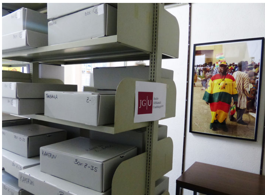
Figure 2: Physical archive of the Online Archive African Independence Days at the Department of Anthropology and African Studies at Johannes Gutenberg University Mainz, © Carola Lentz.