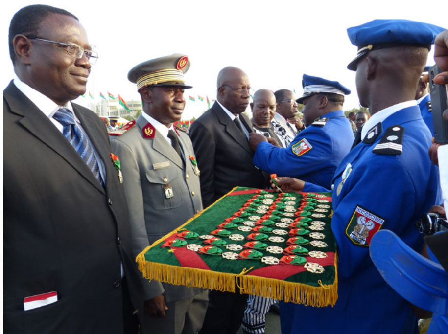
Figure 10: Decoration of Burkinabè during the national-day celebrations of 2013, Ouagadougou, 2013, © Marie-Christin Gabriel.