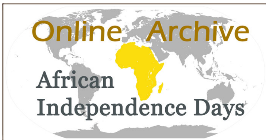
Figure 1: Logo of the Online Archive African Independence Days.

the Congo, Madagascar, Mali, Namibia, Nigeria, and Tanzania (Figure 1). It primarily consists of an online photo archive ( https://bildarchiv.uni-mainz.de/AUJ/ ; https://www.blogs.uni-mainz.de/fb07-ifeas-eng/departmental-archives/online-archive-african-independence-days/ ), while some of the material is also stored in the physical archive on African Independence Days at ifeas as well as in the department's ethnographic collection ( https://www.blogs.uni-mainz.de/fb07-ifeas-eng/ethnographic-collection/ ). Most of the material concerns recent national celebrations, but the collection has been complemented by some documentation of earlier festivities. Taken together, the vast material stored in the archive offers unique insights into practices of, and debates on, national commemoration and political celebrations in Africa and, more generally, practices and processes of nation-building.