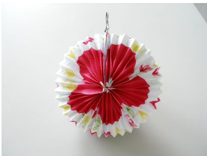
Figure 18, 19: Party hats and lanterns produced for the 50th anniversary of independence in Madagascar, © Helen Okafor.