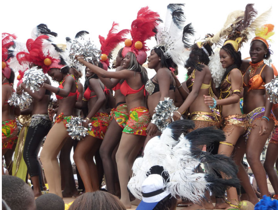
Figure 8: Samba dancers taking part in the carnival parade held during the 50th anniversary of independence in Gabon, Libreville, 2010, © Christine Fricke.

another. In the Burkinabè case, where the ethnically-branded delegations march under the banners of the territorial-administrative units of the state, ethnic diversity is proudly portrayed as a constitutive element of the nation, but is at the same time ‘domesticated’ (Lentz 2017: 130) by subordinating it under the administrative-territorial division of the state. In contrast, the Ghanaian parade is free of any ethnic connotations. Instead, the Ghanaian national-day ceremony mainly evokes ethnicity through dances presented before the parade by school children or, on special occasions such as the sixtieth independence anniversary, by cultural troupes (see Figure 6). This format is another strategy of both showcasing and ‘domesticating’ ethnic diversity: ethnicity is downgraded by presenting it as a supporting programme to the principal state act; it is presented alongside territorial-administrative classification and thus as dependent parts of the nation-state; and it is defused and depoliticised through folklorisation, with dancers in traditional clothes presenting the nation as a colourful mosaic composed of distinct yet equal entities (Lentz 2017).