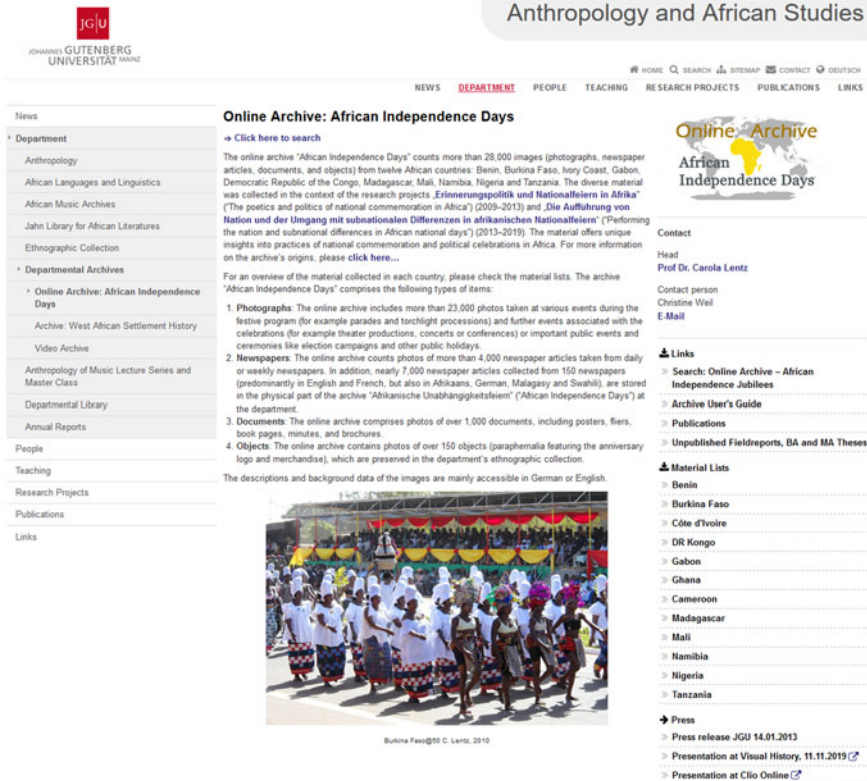
Figure 20: Homepage of the Online Archive African Independence Days.

common technique to place national-day celebrations under a motto (that varies every year) – a strategy that creates variety in otherwise largely standardised rituals and helps to maintain the public's interest, but also channels the official discourses on the nation and the state (see also Gabriel forthcoming ). The official discourses of the fiftieth anniversary of independence in the Democratic Republic of the Congo, for instance, focused on the motto 'The DRC resolutely facing the future' (Petzold 2014: 93; our translation); the dominant images drew on symbols devoid of ethnic associations, but showed instead drawings of (anonymous) persons with whom all citizens could identify (Petzold 2014: 88–101) (see Figure 14 ).