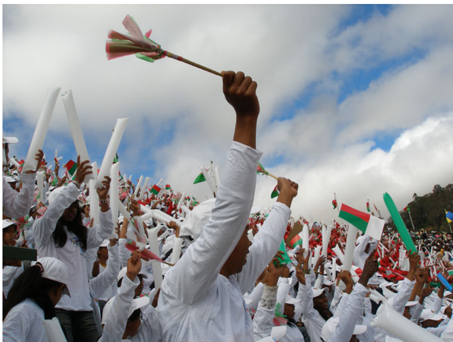
Figure 7: Pupils cheering the military parade held at a stadium in Antananarivo for Madagascar's 50th anniversary of independence, Antananarivo, 2010, © Mareike Späth.

In order to convey an impression of these photographs and their richness for studies on national commemoration and political celebrations in Africa, we present some images of selected activities, namely parades (see Figures 3–8 ) and decoration ceremonies that nearly all African national-day celebrations feature.