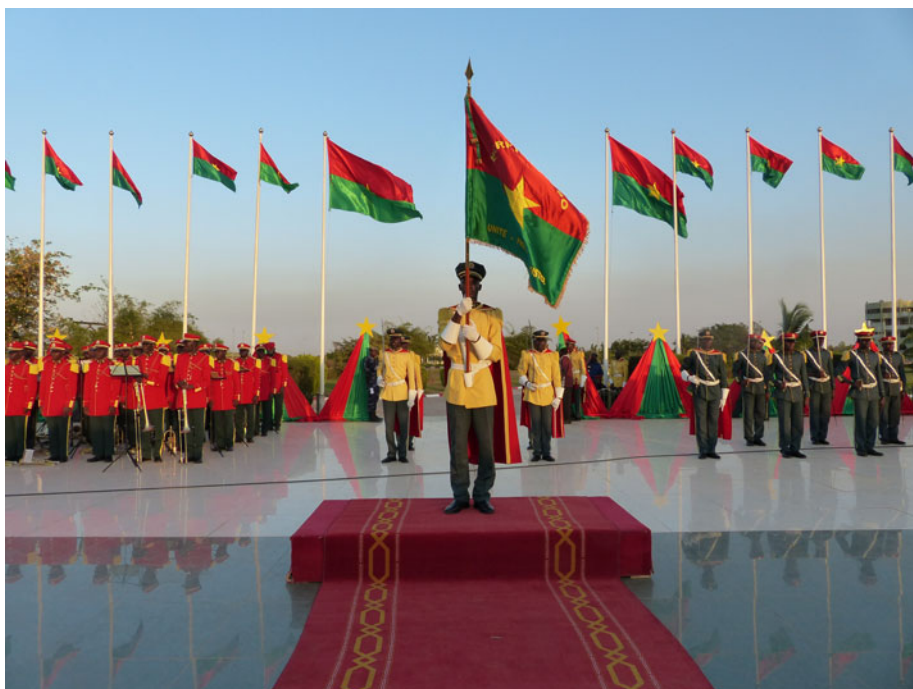
Figure 9: The national guard presenting the national flag during the decoration ceremony organised during the 53rd anniversary of Burkina Faso's independence, Ouagadougou, 2013, © Marie-Christin Gabriel.

President Blaise Compaoré had to revise the list of the designated recipients (Gabriel forthcoming ). More generally, decorations not only honour the citizens but also stage the state and strengthen its legitimacy; by accepting the award, the citizens affirm the state's legitimacy and strengthen its claim as the superior organising authority.