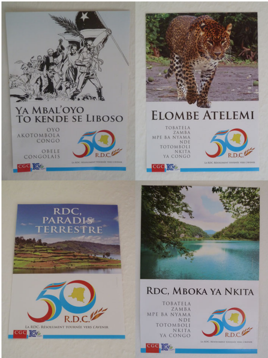
Figure 14: Advertisements promoting the festivities for the 50th anniversary of independence in the Democratic Republic of the Congo, 2010, © Vanessa Petzold.

extended their right hands towards each other, as if they would greet each other across time and space. However, quite a few Ghanaians sharply criticised this iconographic intimation that Nkrumah would endorse Kufuor's government. The Independence Day front page of The Democrat , for instance, a private newspaper close to the opposition, reminded its readers