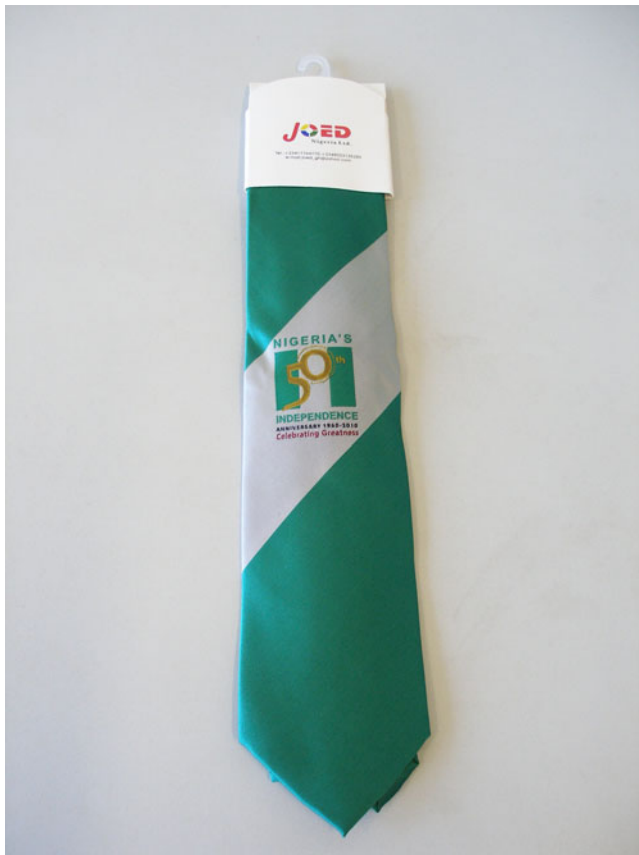
Figure 16, 17: Base cap and tie produced for Nigeria's 50th anniversary of independence celebrated in 2010, © Helen Okafor.