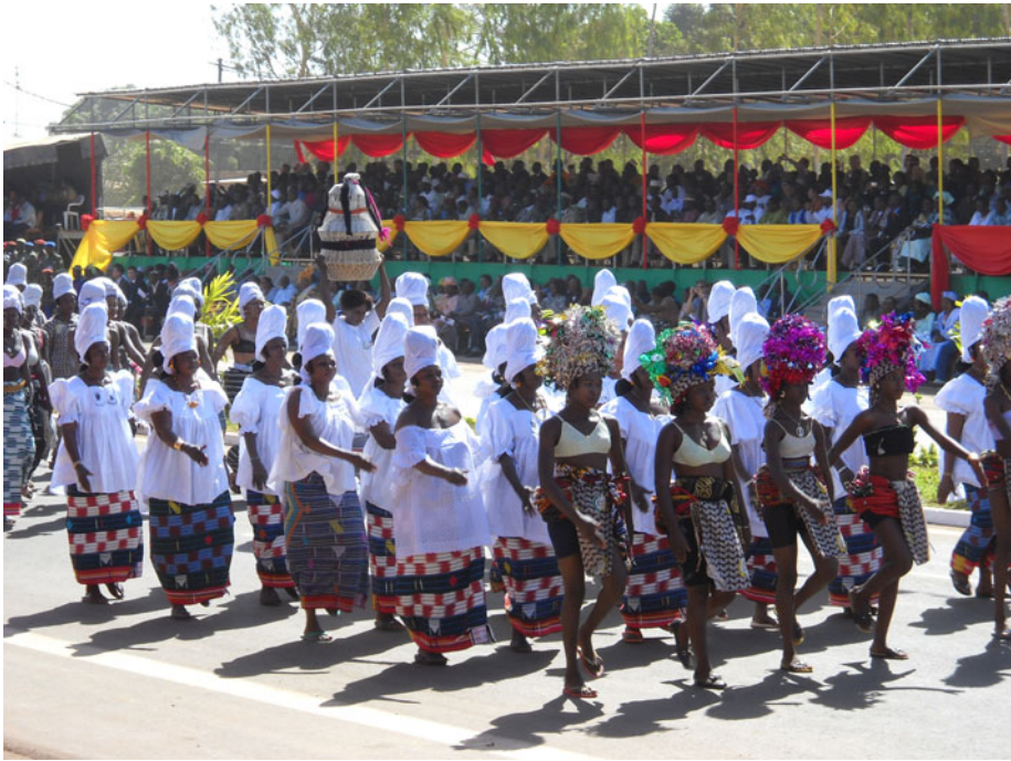
Figure 3: Civilian delegation representing the Bobo, an ethnic group, taking part in the parade held for the 50th anniversary of independence in Burkina Faso, Bobo-Dioulasso, 2010, © Carola Lentz.