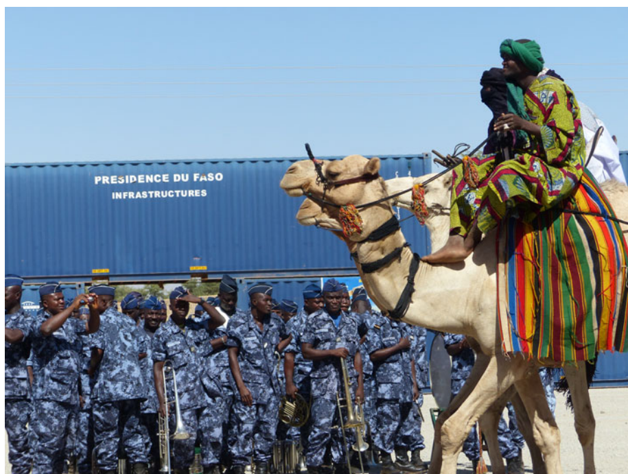
Figure 4: Delegation of camel riders participating in a rehearsal for the parade held for the 53rd anniversary of independence in Burkina Faso, Dori, 2013, © Marie-Christin Gabriel.