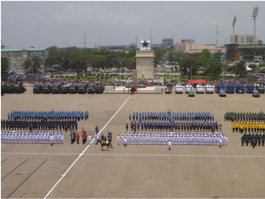
Figure 5: Military parade, which also comprises some delegations of school children, held for the 60th anniversary of independence in Ghana, Accra, 2017, © Carola Lentz.

field of studies of national days, but most research concentrates on Europe and the United States, complemented by some studies on Australia and New Zealand (McAllister 2012; Spillman 1998), India (Roy 2007), and the Middle East (Podeh 2011). African national days, in contrast, have been all but ignored, in spite of the suggestion of the French political scientist Yves-André Fauré (1978) that they were worth studying. The publications produced in the context of the above-mentioned research projects, including several monographs (Haberecht 2017; Lentz and Lowe 2018; Tiewa 2016), one anthology (Lentz and Kornes 2011) and several PhD theses as well as many journal articles and unpublished MA theses and field reports, have significantly helped to fill this gap (for a list of publications and unpublished materials, see https://www.blogs.uni-mainz.de/fb07-ifeas-eng/departmen-tal-archives/online-archive-african-independence-days/ ).