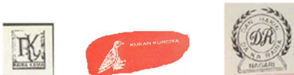
Plate 3: Writers' club logos: Raina Kama, Kukan Kurciya and Dan Hakin da Ka Raina

The identification of a volume as being one produced by the group is most clearly evident in titles produced in the early 1990s, when there was often a logo (see Plate 3) on the front cover,