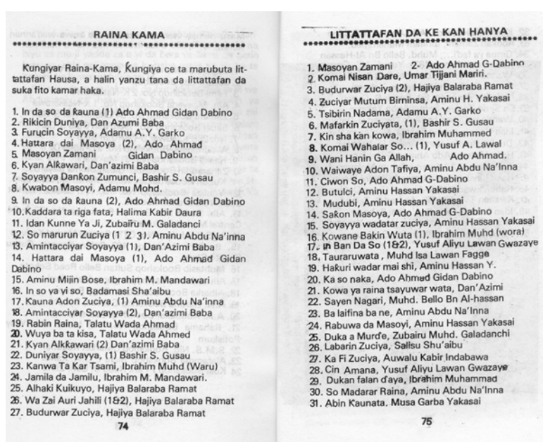
Plate 1: From a Raina Kama book: LH: list of RK titles in print; RH: list of forthcoming titles