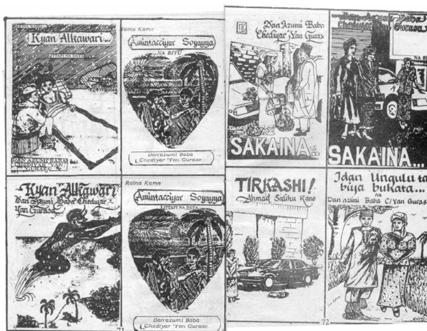
Plate 2: From a Raina Kama book: photocopied front covers of RK titles.

In my own collection of Raina Kama works I have some 52 volumes, not all of which are separate titles, since, as I indicated above, a title is often split into a number of volumes. Going on the basis of volumes that are listed in later RK titles, I estimate that I have about half of the known output of the group. A preliminary guess therefore would indicate that the 75 titles from the three clubs discussed here that are in my possession constitute perhaps half of an estimated 150 (roughly) total production. If the same proportions were to apply to my overall collection then the total corpus for the decade of the 1990s would be perhaps around 1000 volumes. Larkin, however, (1997: 418) estimates 200 books at about the middle of the decade, so perhaps 800 is a closer estimate for the decade as a whole, much closer to Yakasai and Malumfashi's figure referred to earlier. Malumfashi (personal communication) indicates that a very recent study by one Kiyawa, 'Gudummawar kungiyoyin marubuta wajen habaka adabi: nazari daga birnin Kano' (Contribution of writers' groups to the development of literature: a study from Kano city) lists 71 titles from Raina Kama, 14 from Kukan Kurciya, and 17 from another group, Kungiyar Matasa Marubuta 'Young Writers' Association'.